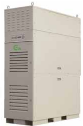
C65 ICHP MicroTurbine